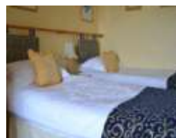
"Whitchurch" ~ navy & gold furnishings, offering twin 3' wide beds & an ensuite luxury "rain" shower with massage jets Can be made up as a Superking size double for stays of 2+ nights. (1 st floor)