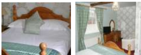
"Shrewsbury" ~ with Laura Ashley Wilton wallpaper in Duck Egg/ Gold, has a 5' wide solid pine, queen size bed with matching furniture & offers an ensuite bathroom with large double ended bath/ shower (1 st floor)