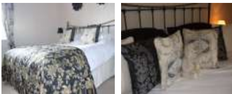
"Hodnet" is furnished in a cream & charcoal colour scheme, with a very spacious 6' wide king size bed and an L-shaped shower/bath ensuite. (1 st floor)

All rooms are individually furnished with rich fabrics, plump duvets & cotton bed linen. All are non-smoking and have private facilities, double glazing, hairdryer, radio/alarm, free WiFi, LCD TV with Freeview & DVD Player, "Tub" toiletries & extensive hot beverage tray