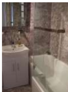
All rooms have Private/en-suite bathrooms/ shower rooms