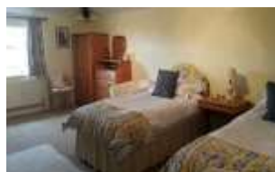
"Mickleley" ~ yellow & blue furnishings, offering twin 3' wide beds & an spacious private bathroom across the hallway with "rain" shower above bath. Can be made up as a Superking size double for stays of 2+ nights. (2nd floor)