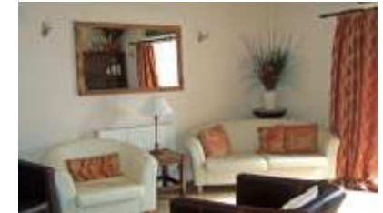
Garden Room ~ lounge with log/ coal fire & patio doors overlooking the fish pool

We are actually situated on the South/East side of that roundabout Latitude: 52.886017 Longitude: -2.542026