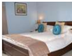
"Wollerton" ~ decorated with contemporary pale blue, cream & chocolate brown offers a 6' wide Superking Mahogany Sleigh Bed and a shower ensuite. (Top 2nd floor)