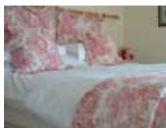
"Wem" ~ decorated with burgundy & cream peacock toile with a 6' wide Superking bed and an L-shaped shower/ bath ensuite. (Top 2nd floor)